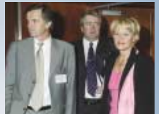
Photographs from the 2nd Rodding Conference in September 2003